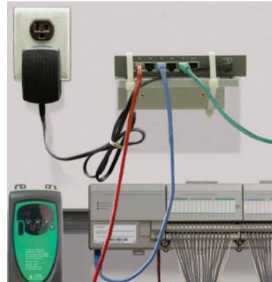
This installation is functionally correct, but it is a messy solution prone to mishap.

from the same source as the other control equipment in the panel.