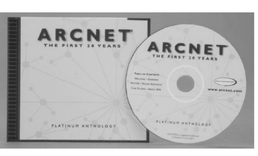
20-year anniversary ARCNET CD