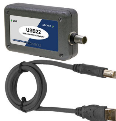
The USB22 NIM is frequently used in applications including data acquisition, machine control, and process control.

The USB22 is RoHS compliant and will be available in May 2006. Models begin at $295.