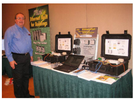
Display featuring BAS Remotes connected to a Jace-2.

Contemporary Controls had an opportunity to display the BAS Remote at a mini Tridium summit hosted by Cochrane Supply, our BAS distributor in Michigan. It was fun (as always) to rub elbows and swap stories with the numerous installers/integrators that attended the conference.