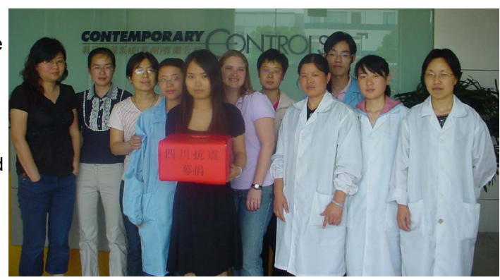
who suffered in the earthquake. Employees hope their money will provide for food, medical supplies and temporary shelter for millions of people who were left homeless.

This earthquake was the worst natural disaster to hit CCC employees make a cash contribution to the Sichuan people China in 30 years.