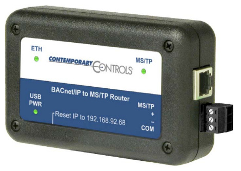
Easily carry the portable router from jobsite to jobsite.

The BAS Router Portable is shipped with a 5' CAT5 Ethernet cable and a 6' USB cable. A resident web server allows